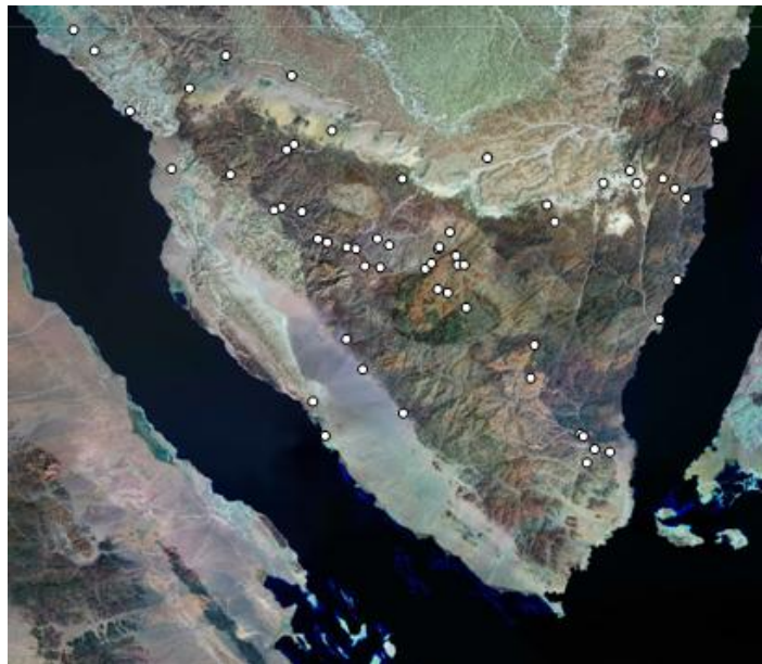
Fig 1: South Sinai showing locations of 62 community meetings. Areas not covered are either uninhabited or compromised by illegal activity.

We were completely taken aback by the strength of response to our meetings. The original Ezay Nakhtar meeting, held in a central venue in St Katherine, attracted just 15 people including ourselves. At our meetings, held eventually in 62 towns, villages and remote desert hamlets, average attendance was 44. No fewer than 2749 people - approaching 7 percent of the whole estimated population - having been offered an arena where they could speak out safely, came together to discuss their ideas, rights and priorities.