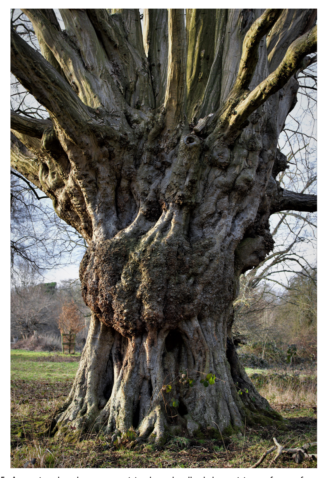
Photo 5. An ancient hornbeam; a surviving lapsed pollard that originates from a former medieval hunting forest. Hatfield Forest, England.