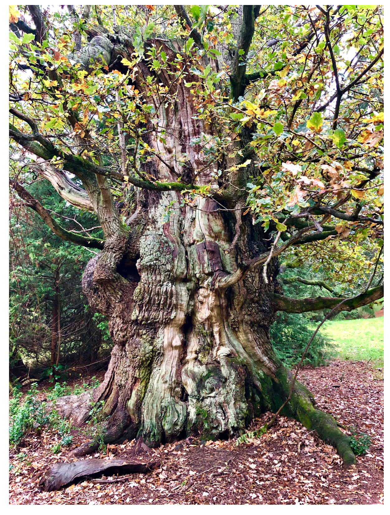
Photo 4. An ancient pedunculate oak; a former forest tree now growing in a historic garden. Chatsworth Gardens, Derbyshire, England.

Article e02013 Photo Gallery October 2022 5