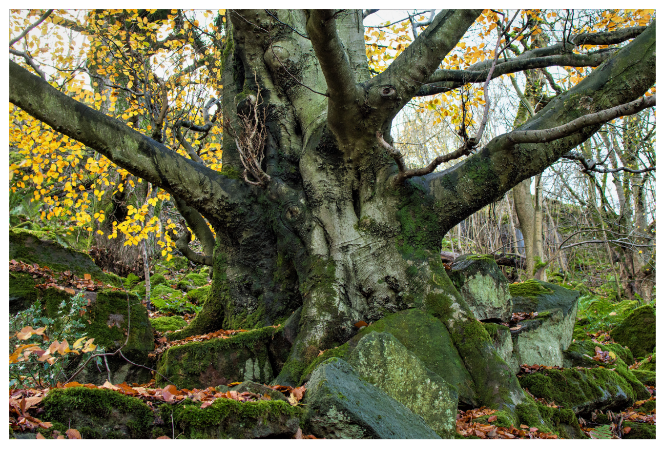
Photo I. A veteran common beech growing in Froggatt Woods. Peak District, England.