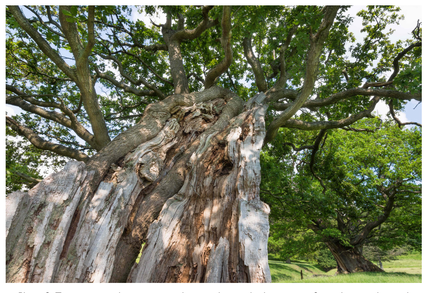
Photo 2. Two ancient oaks growing in a historic deer park, showing significant decay in the trunk in the foreground. Chatsworth Park, Derbyshire, England.

Article e02013 Photo Gallery October 2022 3